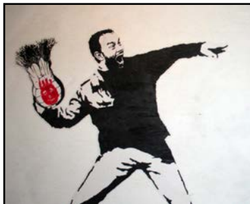
Pic. 6 Wilson Chucker by Banksy

In this part I will be giving some examples of how Banksy's works have generated reaction from the public.