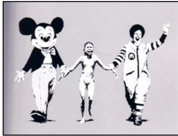
Pic. 5. Can't beat the feeling'.

One of propaganda's main goals is to appeal to the emotions 32 . Undoubtedly, that relates to Banksy. A illustration depicting Jesus Christ on the cross holding shopping bags, two English policeman kissing, the Queen seated on somebody's face as an innuendo to