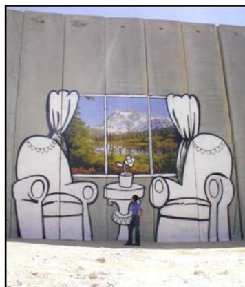
Pic. 8 Bethlehem 2005, Israel's West Bank barrier.

the wall – and the pictures, help us to form a meaningful proposition by means of visual syntax. The wall, representing “reality”, acts as a canvas for the set of ideological strokes that are contained in the illustrations. Edward Tufte in his book “Visual Explanations: Images and Quantities, Evidence and Narrative” talks about the integrity of visual evidence: