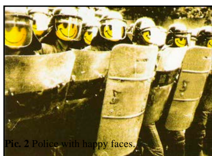
Fig. 2 Police with happy faces.

For propaganda to be effective it needs to be relevant to the contemporary and so it is