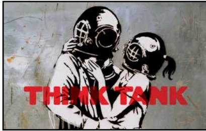
Pic. 4 Blur's Think Tank cover art

The effect on select target audiences is relevant to Banksy's message. Traditionally graffiti has acted as a medium of mass communication, since it is created in public spaces. Banksy started as member of a crew that sprayed on walls, but as his reputation grew, his audience changed; by doing stunts at museums he reached a crowd that may have been slightly more educated, and other artists; in doing exhibitions abroad his appeal went beyond the local population; while activists started to show more interest as he displayed images through different subjects and locations like animals and zoological parks. In 2003, Blur's seventh album Think Tank featured a spray painting by Banksy on its cover, ensuring an even broader exposure. The album was well received in the United States and in 2007 the album's cover art was sold, setting a new auction record 25 .