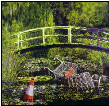
Fig. 1 Show me the Monet