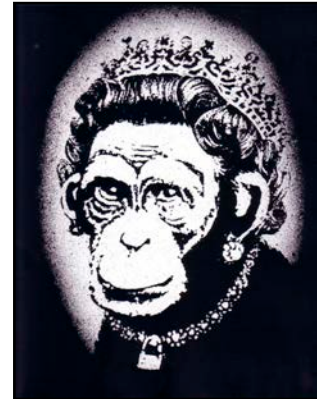
Pic. 3 Who sacked all the clowns?

anti-Graffiti manoeuvre in history, named Operation Anderson 17 , and consisting of house raids on suspected “writers” 18 . After that, several significant events had an impact on Banksy’s work: the Guantanamo Bay complex in Cuba, the monarchy in UK, the invasion of Iraq, London’s anti-capitalist demonstration on May Day 2000, the raising of Israel’s West Bank Wall, and several others concerning environmental issues, child abuse, the role of advertising, and mainstream culture. Artists are usually seen as special, because of a combination of their talent and how they appear to us, which creates an enigma that makes us curious to try to know their views. That mystery characterizes Banksy and his work. He uses monkeys to represent intelligence, linking them with evolution. In Picture 3, a monkey is shown as Queen, a representation of a myth of entitlement and superiority, which is given by default, not by achievement. The race is not fair, if someone has that kind of privilege and the biased support of others, and that is why people give up and placidly become part of the audience.