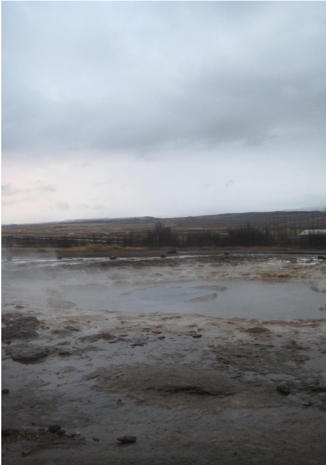
The Geysir Area, Iceland.