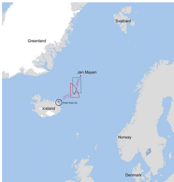
The Picture shows the location of the Dreki area. 562

islands), in accordance with Icelandic laws and regulations transposing relevant EU rules, and international agreements between Iceland and Norway. 561 The Second licensing round for exploitation for the Dragon/Dreki Area (see picture) in the North Atlantic Sea started 3 October 2011 and the deadline was 2 April 2012.