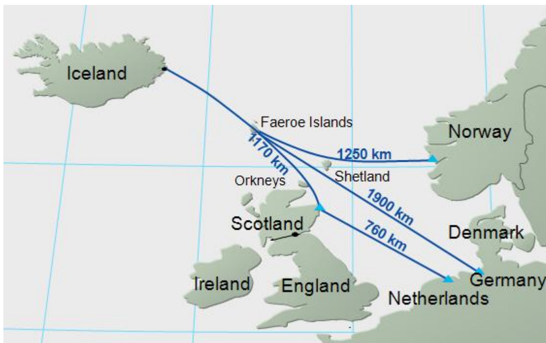
Picture showing the possible routes from Iceland and to the Continent for a submarine cable. 616

Iceland's legal framework for the electricity market is highly in line with the Second Energy Package from the European Union, due to transposition of rules implemented into the EEA Agreement. But there are, as previously mentioned some special derogation for the special circumstances in Iceland. 617