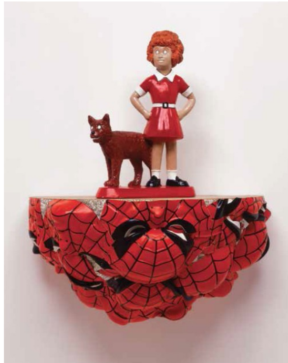
(fig.9) Haim Steinbach, Shelf with Annie figurine , 1981