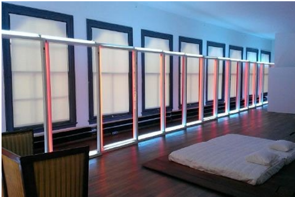
(fig.4) The fifth floor, bedroom, Judd Foundation, 101 Spring St, NYC