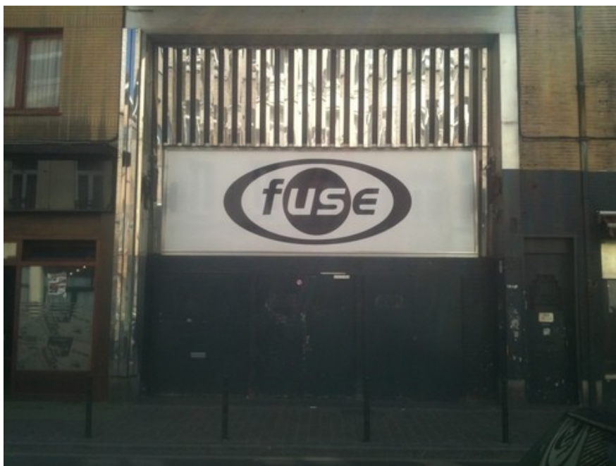
(fig.13) Fuse, night club, Brussels, Belgium