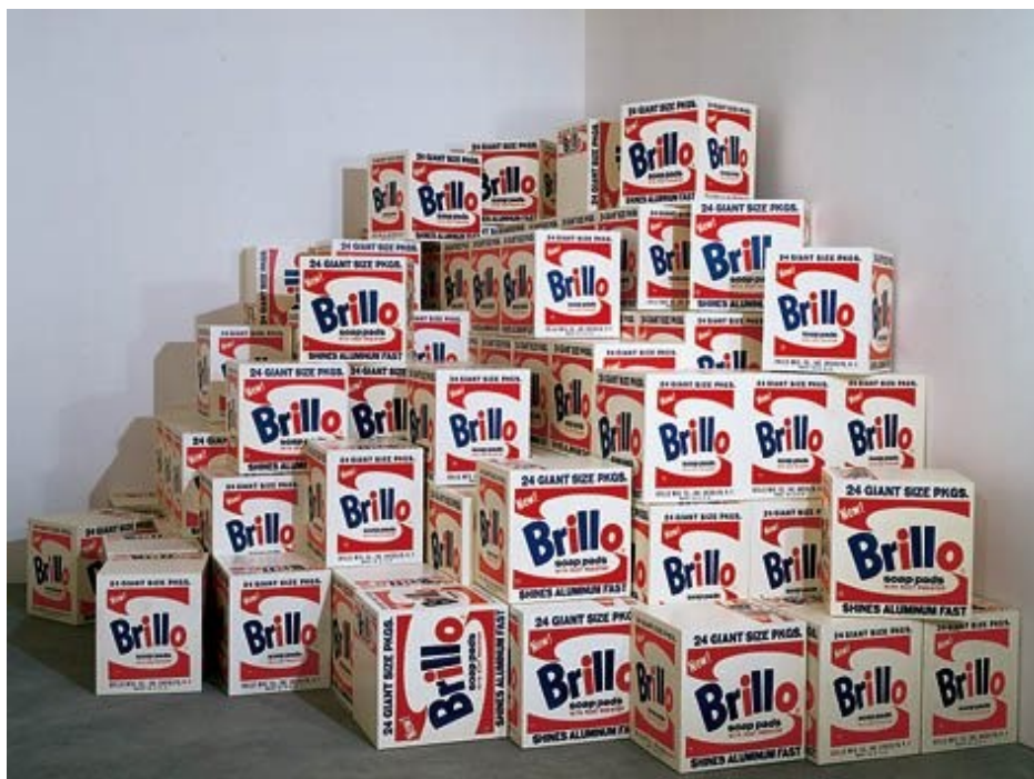
(fig.16) Andy Warhol, Brillo Boxes , 1964