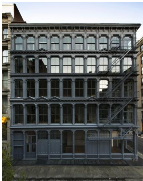
(fig.2) Judd Foundation, 101 Spring St, NYC