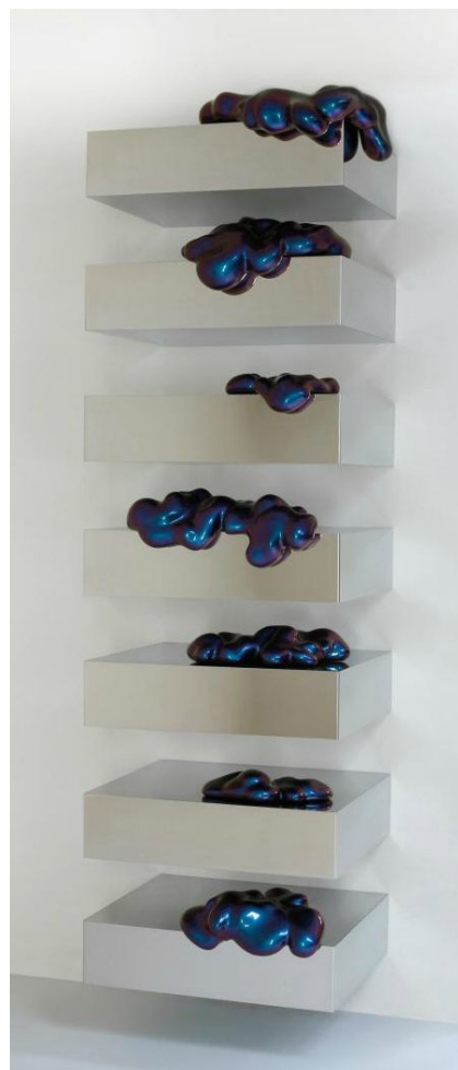
(fig.6) Sylvie Fleury, Eternal Wow on Shelf , 2007