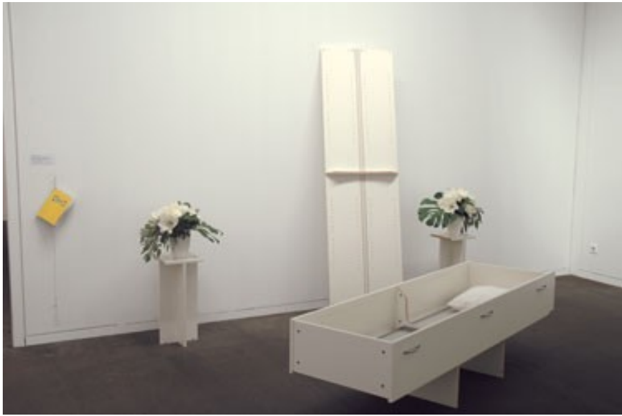
(fig.7) Joe Scanlan, DIY , 2008