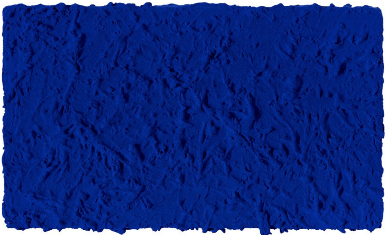
(fig.8) Yves Klein, Propositions Monochromes (I'02) , 1957