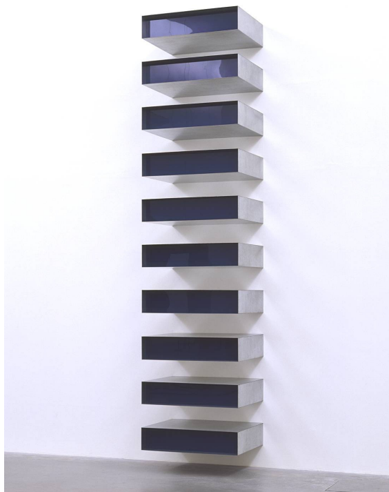
(Fig.1) Donald Judd, Untitled , 1980