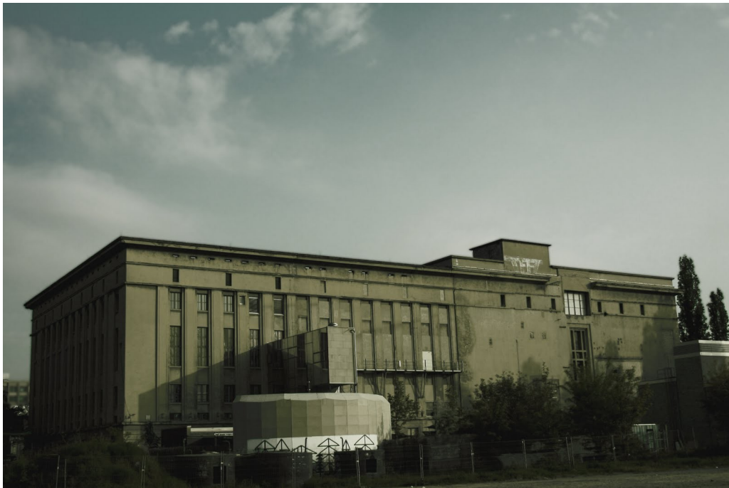
(fig.11) Berghain, night club, Berlin, Germany