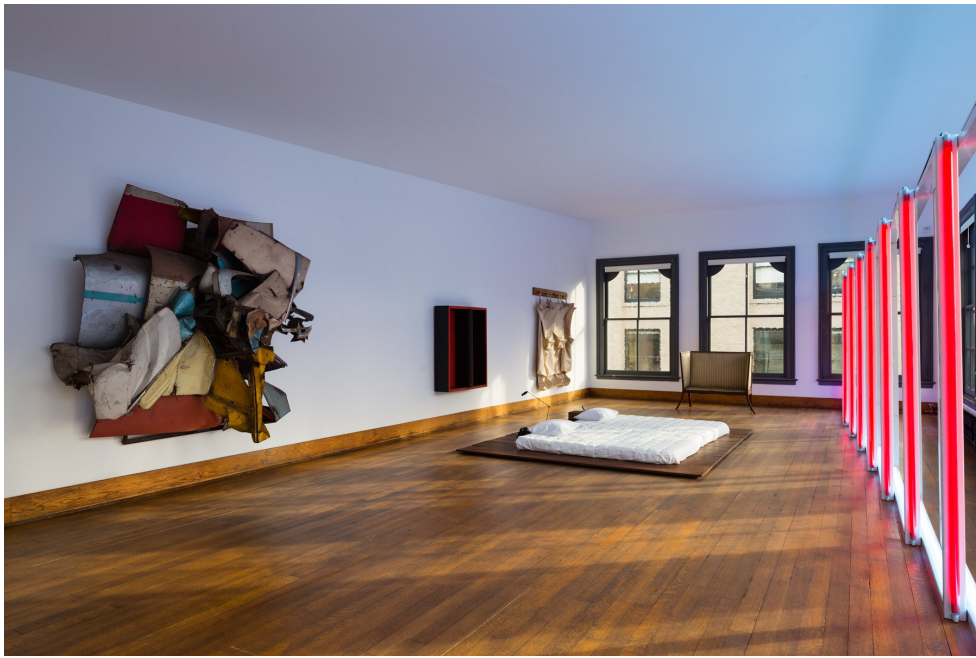
(fig.3) The fifth floor, bedroom, Judd Foundation, 101 Spring St, NYC