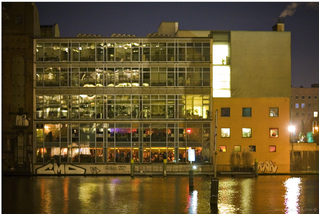
(fig.12) Watergate, night club, Berlin, Germany