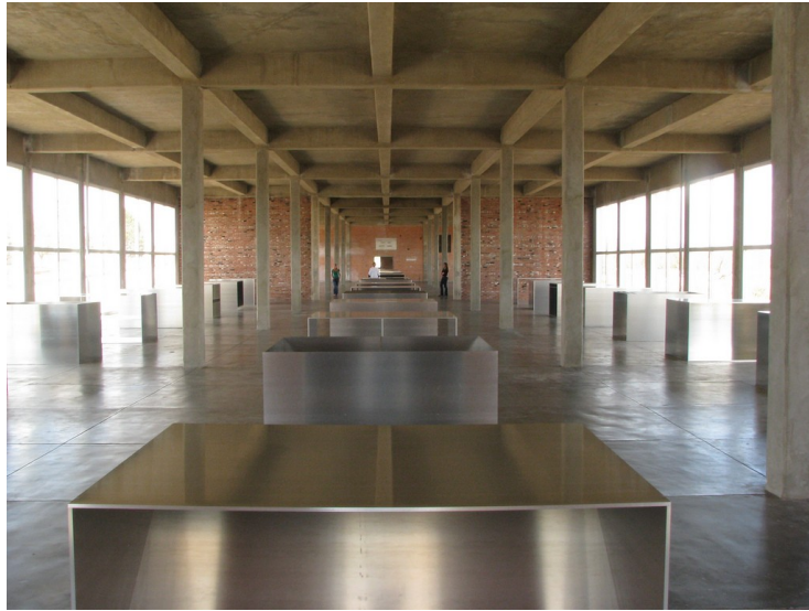
(fig.5) Judd Foundation, Marfa Texas, work by Donald Judd