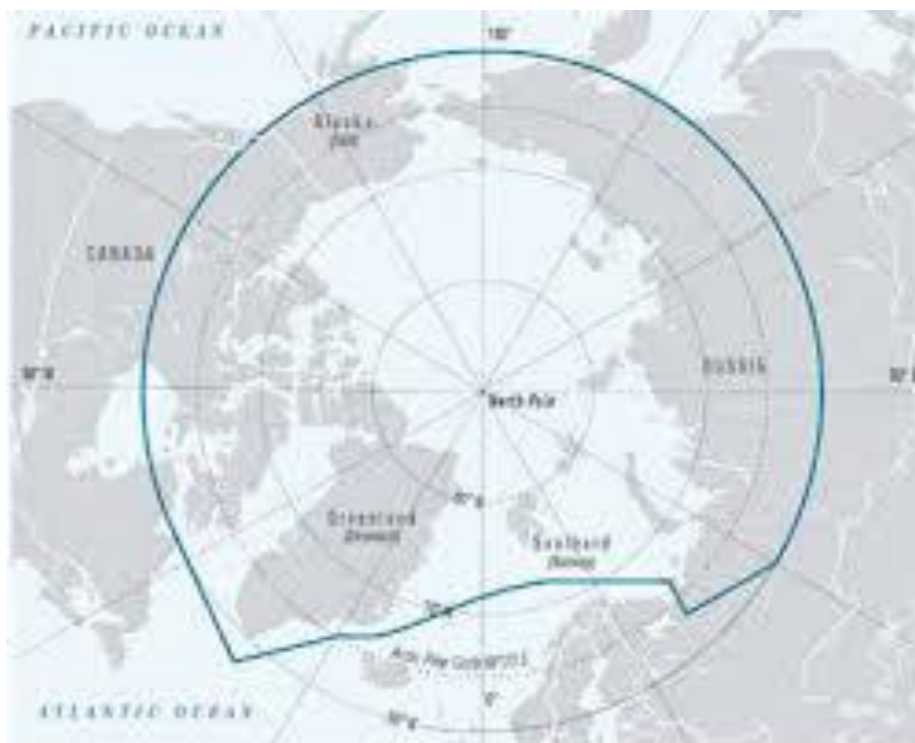
Figure 1. The area of application of the Polar Code in the Arctic. 1

The main text of the thesis begins with chapter two, which aims to answer the question of why cruise tourism in the Arctic is growing by discussing both the tourists' own interests and the political motivations behind promoting ship-borne tourism in the region. Chapter three outlines the main environmental effects of cruise tourism. The issues are addressed from ecological, economic, and social points of view. Chapter four discusses the different definitions of sustainable development and sustainable tourism, and the sustainability issues raised by cruise tourism in the Arctic. After clarifying these aspects of the challenge, the thesis goes on to address the law regulating the protection of the marine environment. Chapter five deals with the main principles of environmental law, first defining each principle and then exploring how it bears upon the environmental issues arising from