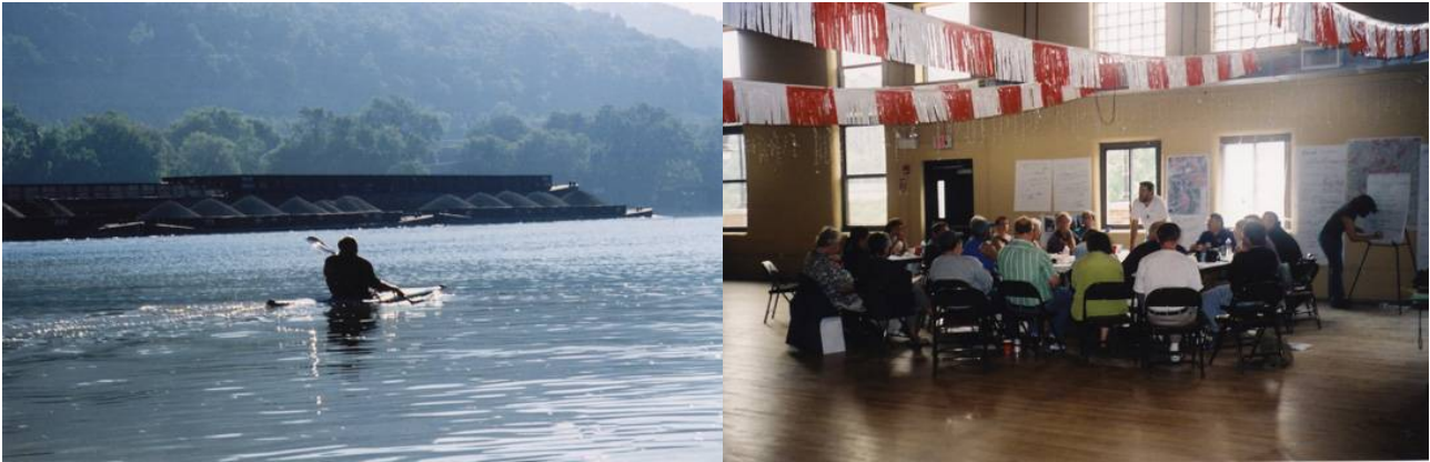
(Left) Along one of the 3R2N water trails. (Right) One of the community workshops during 3R2N.

more clearly articulate how people value the rivers, what the issues are, and what the opportunities are (Collins, 2004). In Goto's (2006) words, these dialogues aimed to discover "new ways for people to speak and to see, and to find new ideas and methods for creative engagement with our place." In particular these free-of-charge boat tours were an unconventional space for interaction that helped generate fresh dialogue and creative ideas (Collins, 2004).